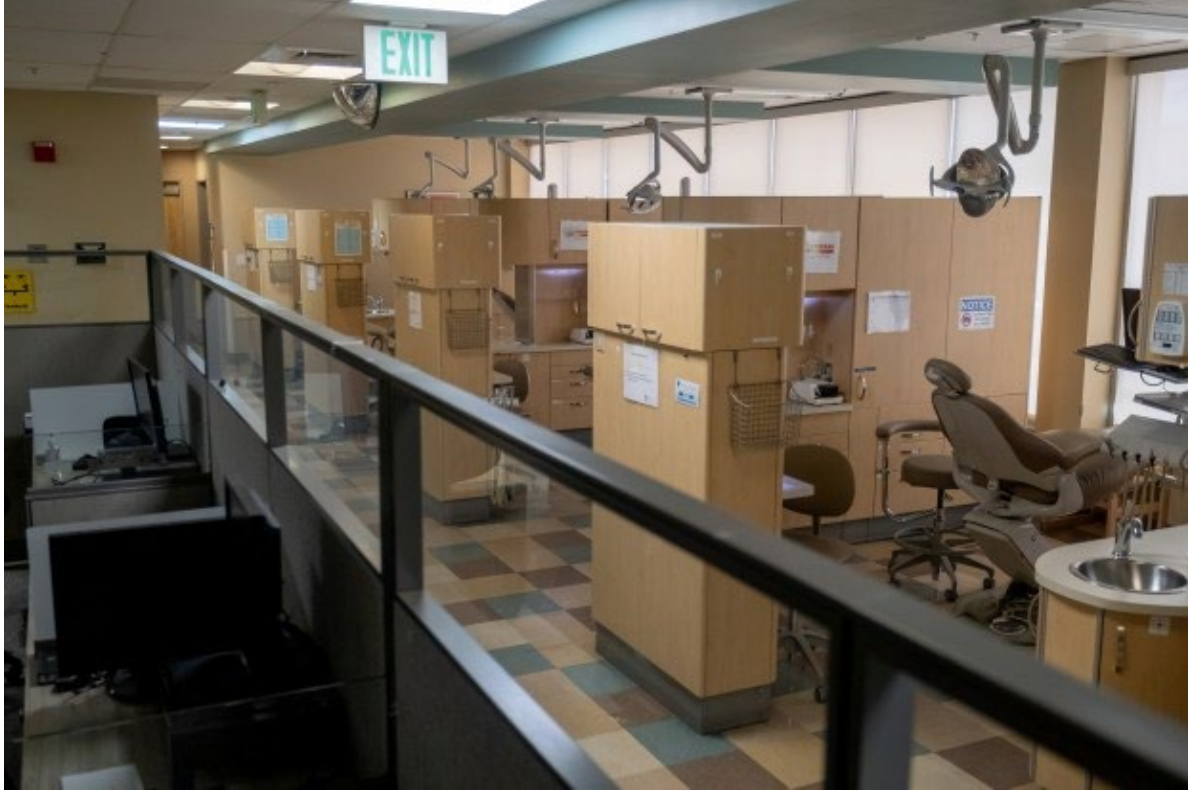
Clinica Family Health's shuttered dental clinic sits empty on Thursday, May 2, 2024, in Adams County.