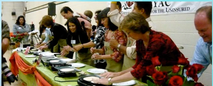
Tortillas for Tepeyac